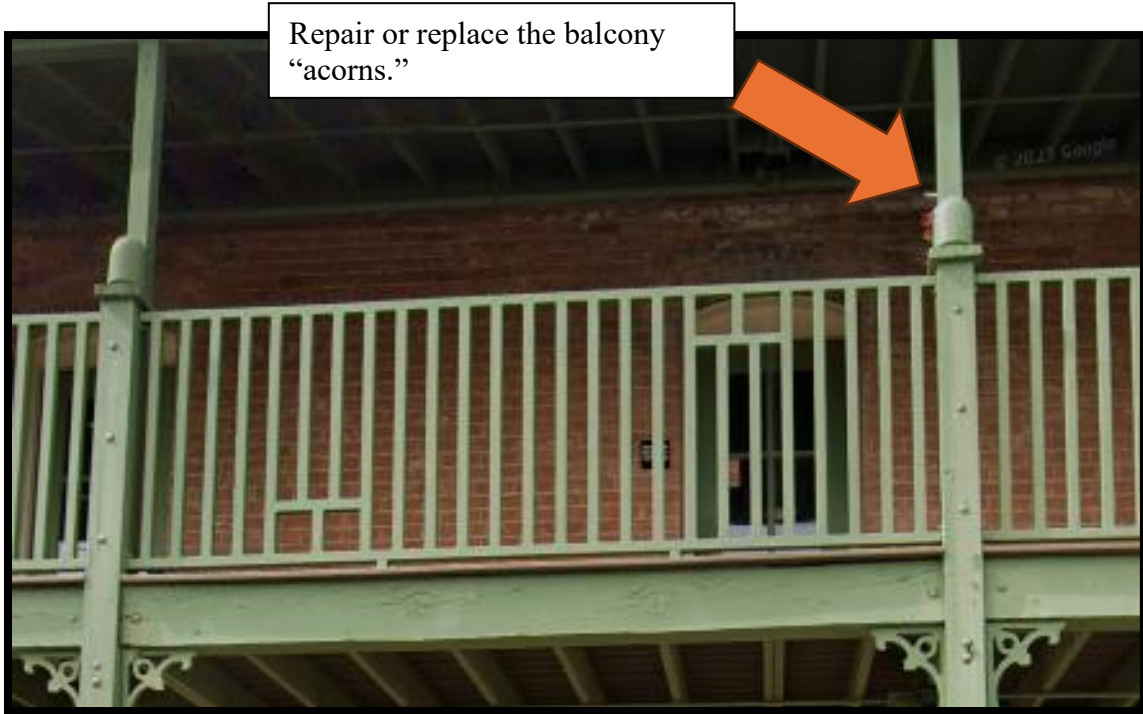
Figure 2: External repairs include the repair and replacement of balcony "acorns."