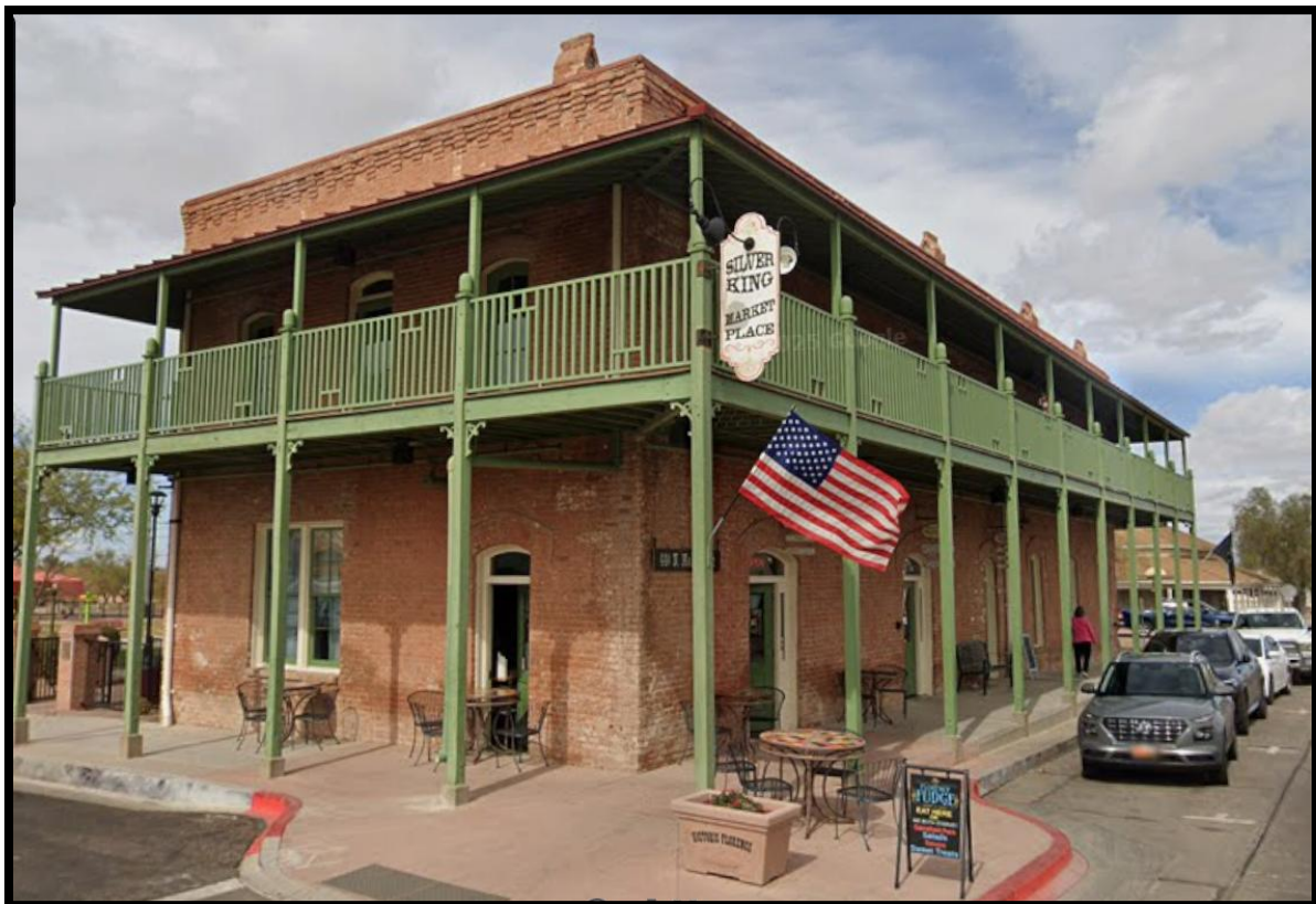
Figure 3: External repairs will include brick refinishing.